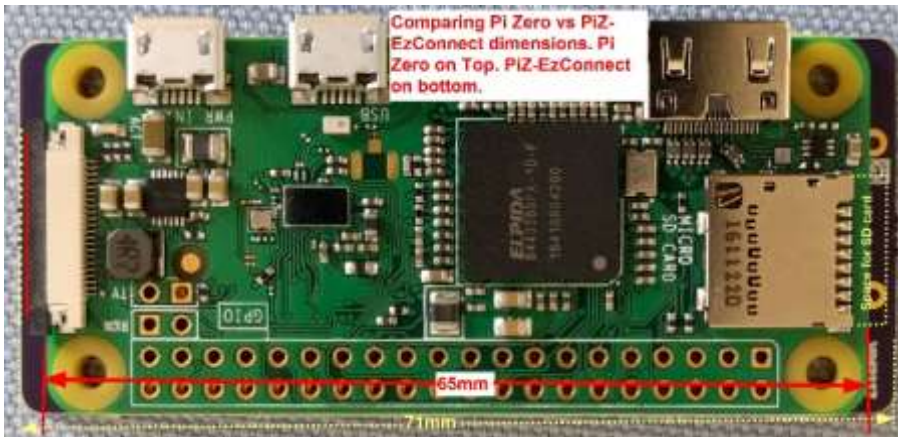
Comparing Pi Zero and PiZ-EzConnect dimensions.

The Pin definitions for a Raspberry Pi are shown above. PiZ-EzConnect replicates the above connections.